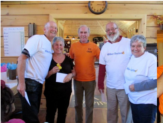
Second: the Four Pistons